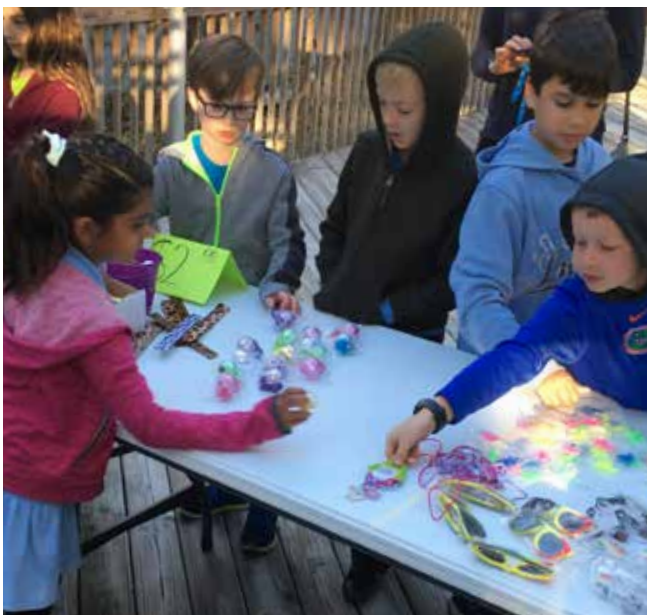
Upper Primary students take turns working in the "Safari Store," applying their math knowledge to sell toys to classmates and calculate change. The money they raise supports Big Cat Rescue.

Both Big Cat Rescue and Heifer International sent representatives to Corbett Prep to talk with the students about their missions and thank them for the donations. Students learned the tangible ways their gifts would help others and began to see how, through community service, even a first and second grader can make a positive change in the world.