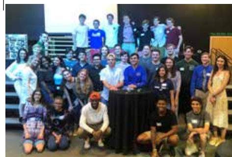
The Class of 2015 returns to Corbett Prep before their high school graduations for a reunion with former classmates and teachers.

Corbett Prep Alumni, emailing alumni@corbettprep.com or filling out the online form at www.corbettprep.com/alumni .