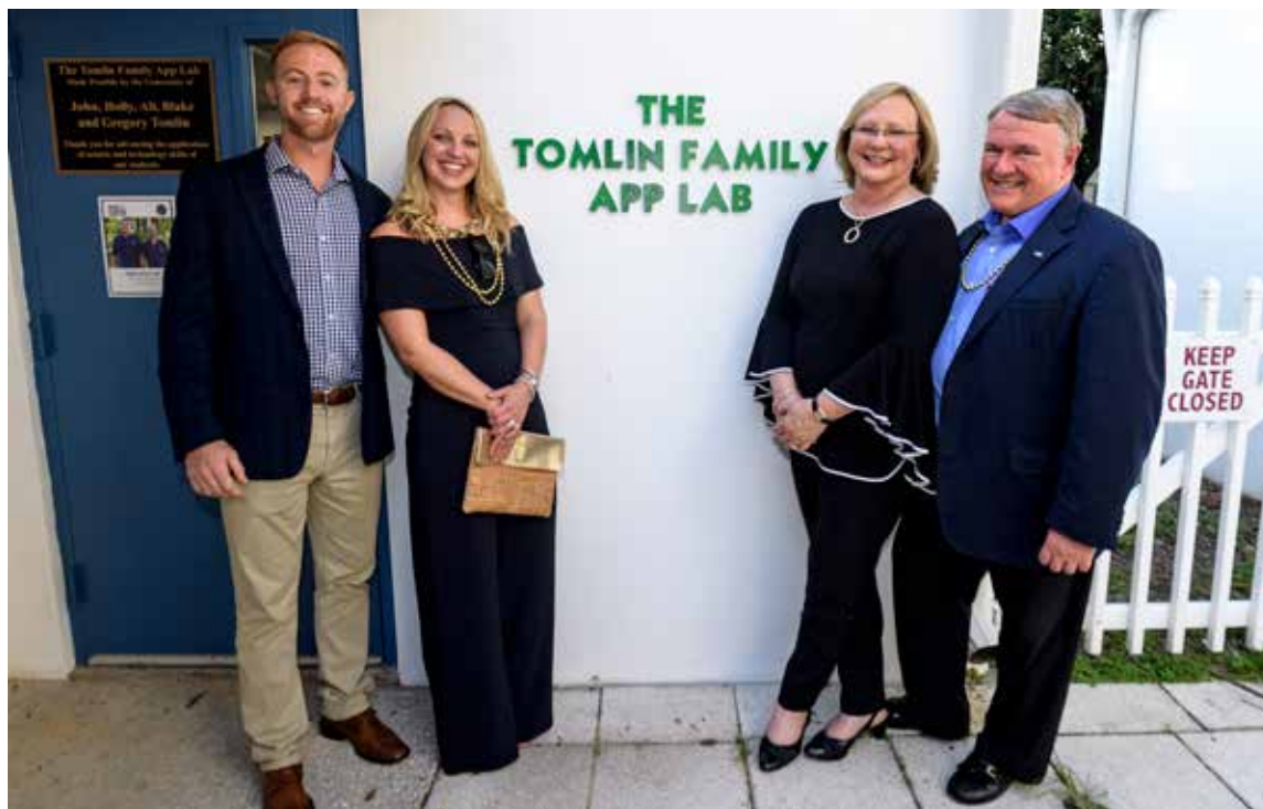
Corbett Prep held a special dedication at the 50th anniversary event with the Tomlin Family to officially rename the Application Lab in their honor. The Tomlin Family App Lab engages students in all grades with cutting-edge technology as well as carpentry and crafting tools for projects that encourage problem solving and discovery.

The Tomlin Family App Lab, dedicated during the reunion,