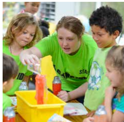
CAMP IDS offers more than 100 half- and full-day camps at Corbett Prep in the summer. CAMP IDS 2020 runs from June 8-July 24.

Three-quarters of campers surveyed in the American Camp Association study said summer camp gave them the chance to try activities they were afraid to do at first. And 63 percent of parents reported their children continued those activities after camp ended.