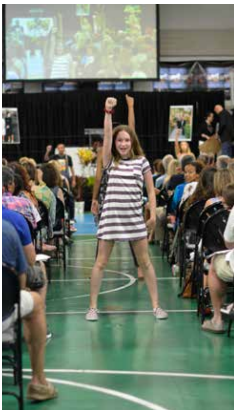
Middle School musical theatre students entertain the crowd at the anniversary event. From an early age, Corbett Prep students learn to project poise and confidence in front of audiences as public speakers or performers.