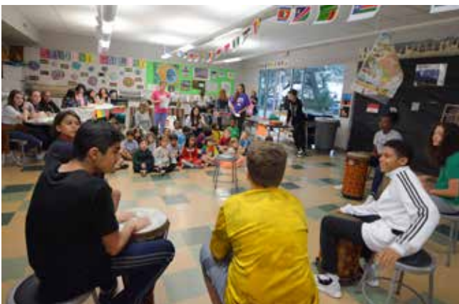
Middle School students share their knowledge of other cultures with the rest of the school through Our World Day activities.

These opportunities for students to travel abroad and host international visitors, along with the International Baccalaureate Programme and the newly revived International School Connection, raise global awareness and open up the world to Corbett Prep students.