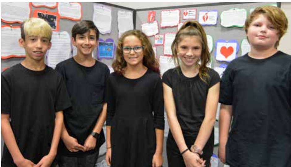
Fifth graders research causes they choose for Exhibition, a project that asks them to draw from their experiences as students in the IB Primary Years Programme.

Reflection is also an important part of the process in Exhibition and the Middle School project. In addition to expanding their knowledge of research, communication and problem-solving, students look back on the IB learning experience and consider the outcomes of their work – key skills as they prepare for success in the next stage of their education and as contributing members of their communities in the future.