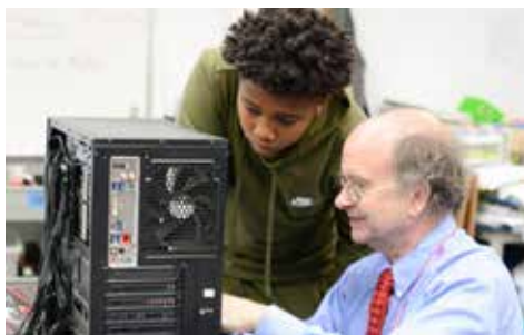
Middle School students learn how computers work by building them in the App Lab.

An experiential classroom named to honor a devoted alumni family, the App Lab at Corbett Prep is a place of creativity and inspiration for students of all ages.