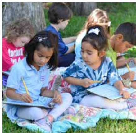
An engaging Early Primary curriculum helps turn students into lifelong learners.

Corbett Prep teachers use the International Baccalaureate Primary (IB) Years Programme to guide students through stimulating units of inquiry in ways that support Dr. Howard Gardner's theory of multiple intelligences as well as engage all learning styles. The PreK4 and kindergarten "Living Thanksgiving" unit introduces early American history with stories that appeal to verbal and linguistic intelligences and activity stations that involve naturalist or kinesthetic intelligences.