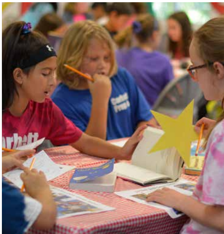
Intermediate Division teachers hosted a "book tasting" to generate excitement about reading. Students browsed displays of award-winning books to discover new books in different genres that interested them.