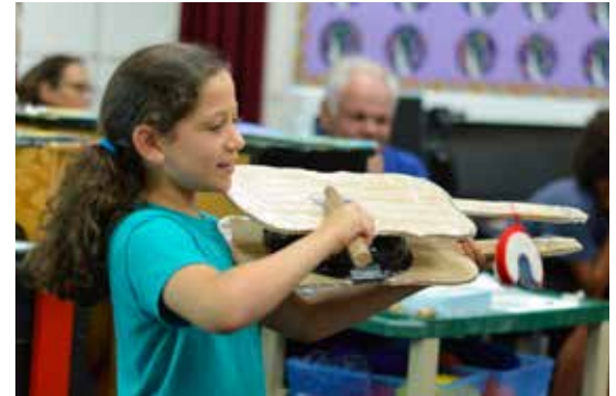
Students built instruments out of trash and building scraps. In music class, they used their creations to perform original compositions.

The Recycled Orchestra lessons encompassed multiple classes and subject areas. Music teachers wove Ada's Violin into