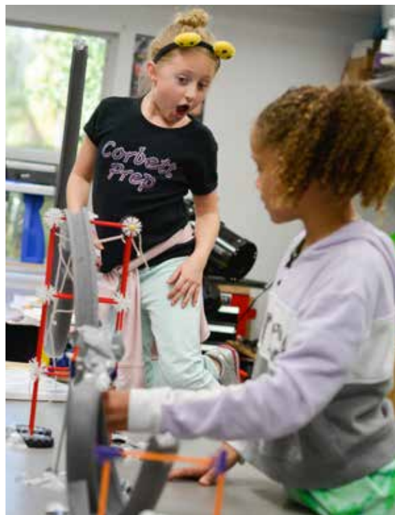
Fourth graders experiment with roller coaster designs to see what is most effective for racing marbles.

when they work as teams, they can solve problems by bringing their unique skill sets together.”