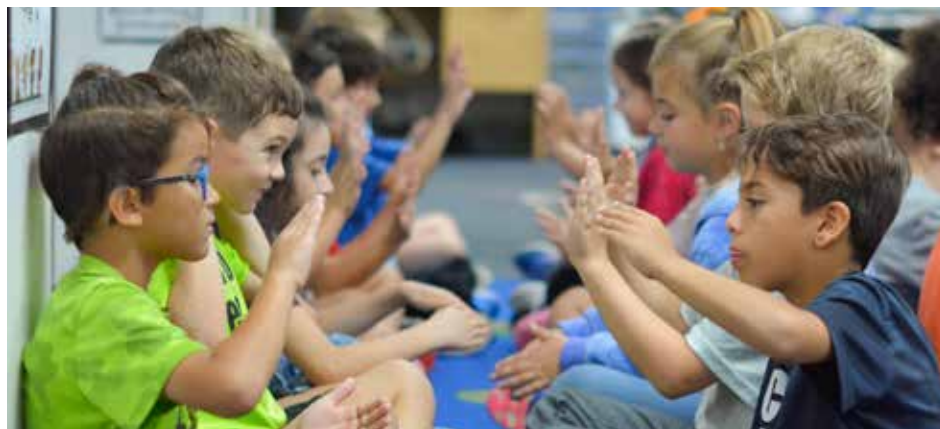
First and second graders perform a slow-motion mirroring exercise to help them practice mindfulness, one of the Four Pillars of Wellbeing that Corbett Prep piloted internationally.

As the first school to use the Four Pillars, Corbett Prep saw firsthand how the right combination of strategies to promote wellbeing benefits students and the school community as a whole. Corbett Prep students have learned ways to practice mindfulness, how to identify emotions and what triggers them, techniques to pursue contentment and balance, and the support roles communities play in resolving conflicts and reaching goals.