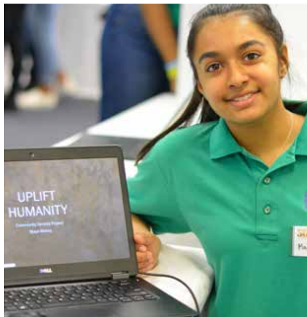
Students in eighth grade investigate a need and consider it from a global perspective as part of the IB Middle Years Programme Community Project.

Fifth graders communicate what they have learned through an impassioned performance and