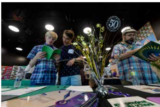
Guests at the anniversary celebration had a chance to walk down memory lane and browse comprehensive displays highlighting moments from throughout the school's 50 years.

grade now have access to the latest technology, and teachers benefit from numerous professional development resources. But the heart of the school remains the same.