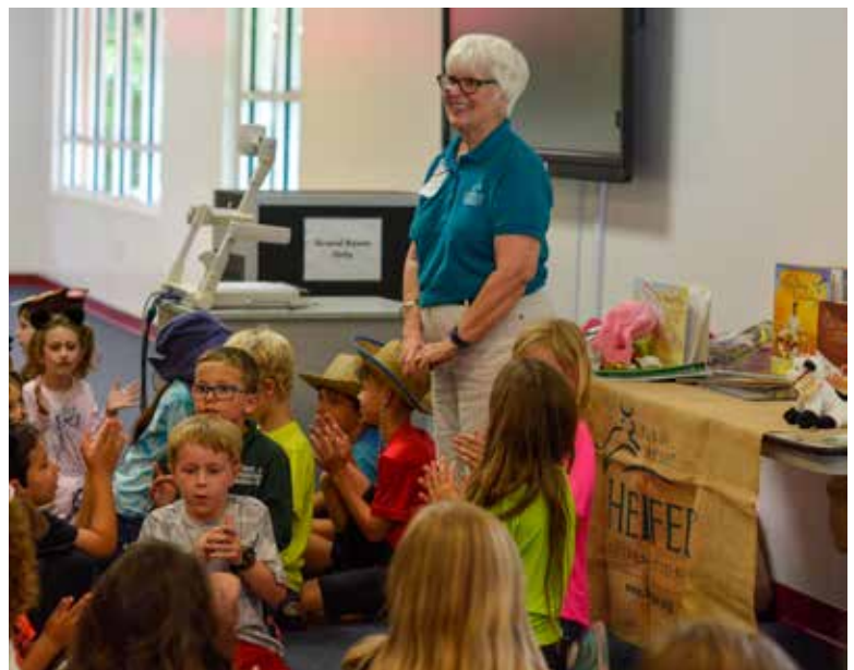
A Heifer International representative visits with first and second graders to explain how Heifer helps people internationally to support themselves. Students read books and collected donations for the organization.