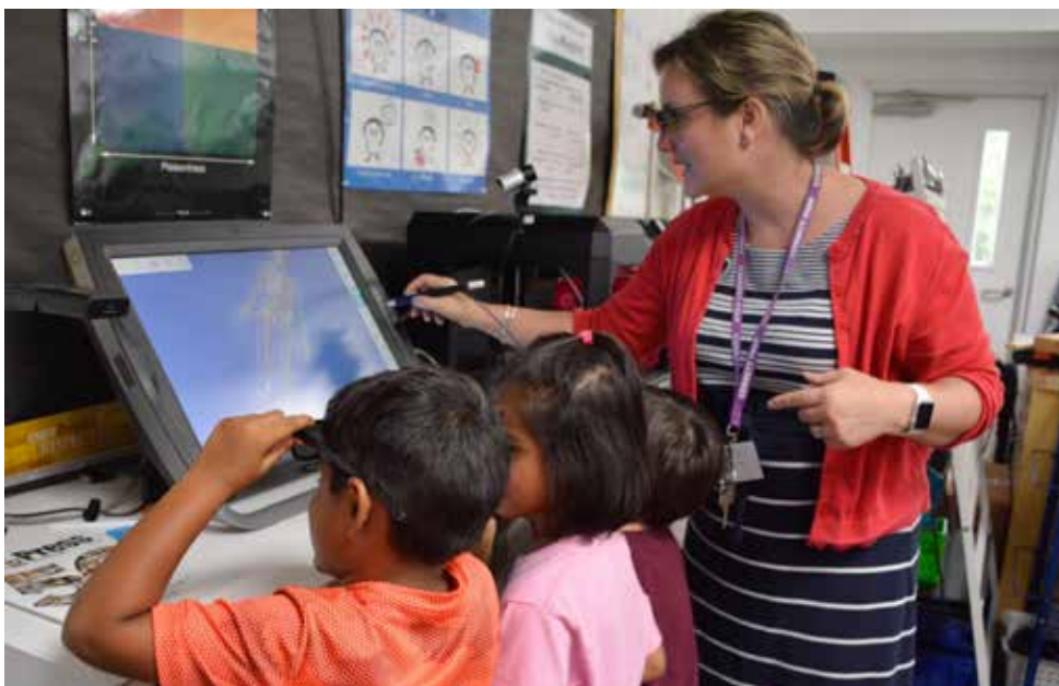
PreK4 classes enjoy the zSpace technology in the App Lab, which allows them to interact with 3-dimensional models of human hearts, part of their studies of body systems.